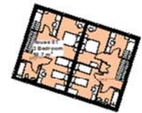
FIRST FLOOR HOUSE PLAN

www.quattrodesign.co.uk NOTES The drawing is the copyright of Quattro Design Architects Ltd and shall not be reproduced or used in any form without written permission. Only spatial dimensions to be used for construction. Check all dimensions twice. Any discrepancies should be reported to the ADDRESS as soon as possible. REVISIONS REV. DATE - DRAWN - CHECKED - NOTES -- 16/10/20 - NEM - Drawing Created