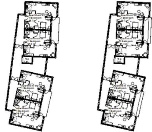
FIRST & SECOND FLOOR PLAN APARTMENTS

Accommodation Schedule GF = 313m 2 - 4 Apartments (4no. 1B) FF = 313m 2 - 4 Apartments (4no. 1B) SF = 313m 2 - 4 Apartments (4no. 1B) Total Apartments = 12 Total GIFA = 939m 2 Internal floor space to apartments = 652m 2 Ratio 69/31